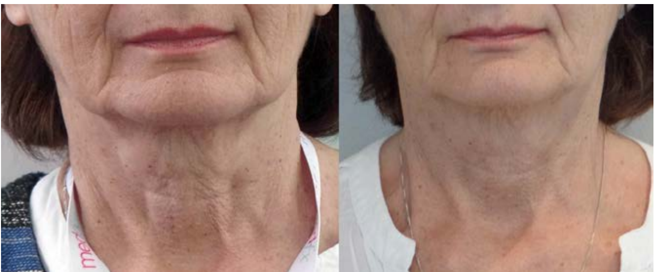
Before (Left) and After (Right) of neck treatment with PROFHILO after 2 months.