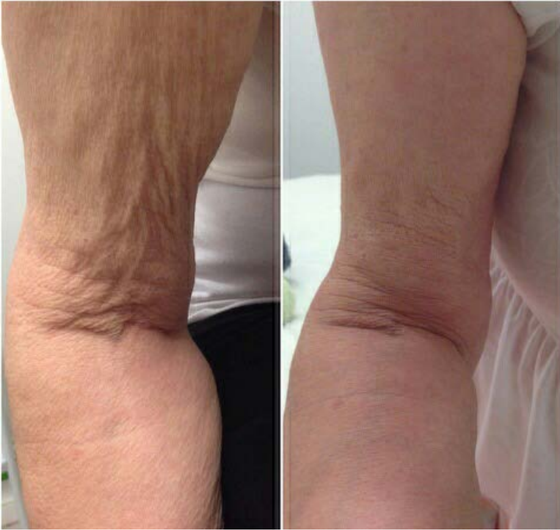
Before (Left) and After (Right) PROFHILO treatment for skin laxity in the arms.