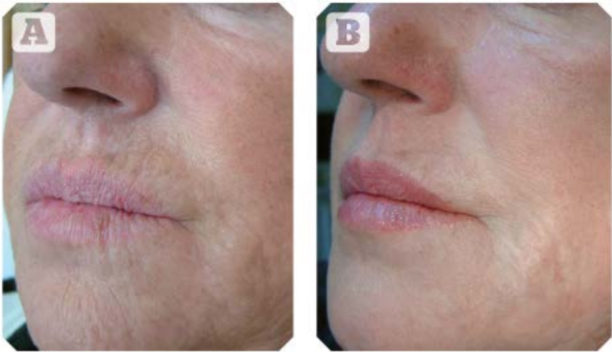
Figure 3 (A) Before treatment, and (B) 1 month after second treatment